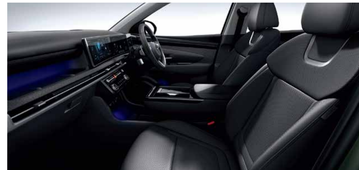
Black Mono + Pattern Insert Film (NNB)