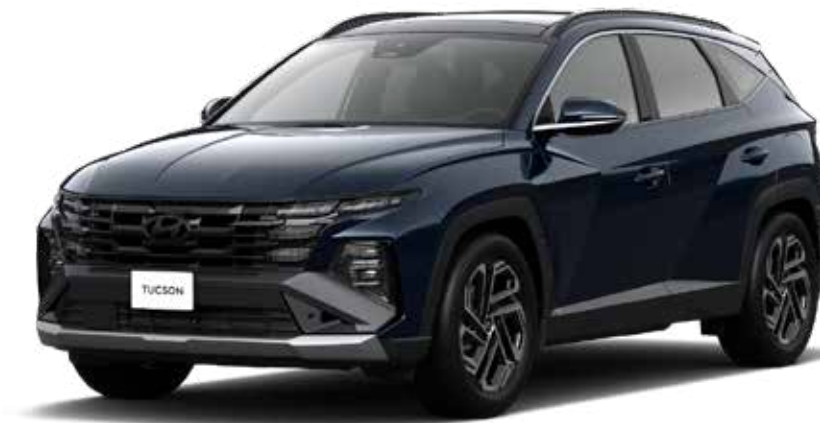
Ocean Indigo Pearl (PS8)