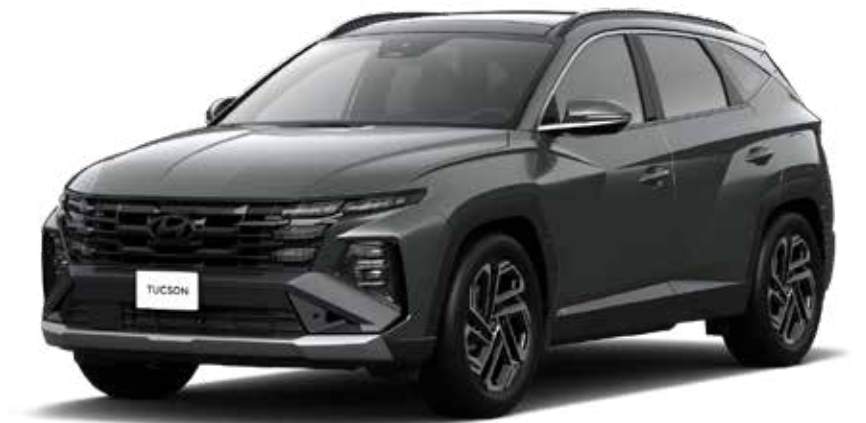
Amazon Gray Metallic (A5G) Only for Prestige.