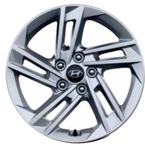
17" Alloy Wheels Style