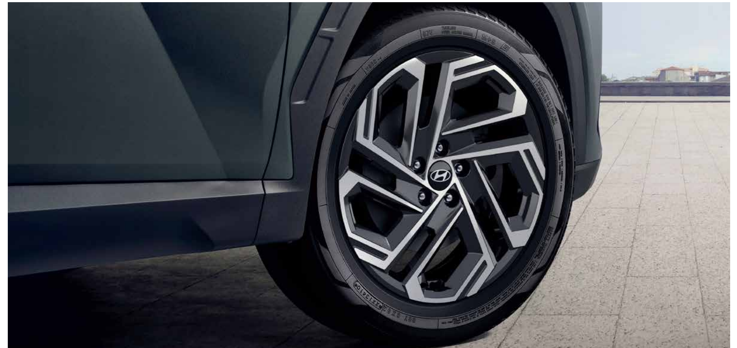
19-inch Alloy Wheels