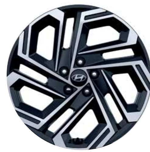
19" Alloy Wheels Prestige