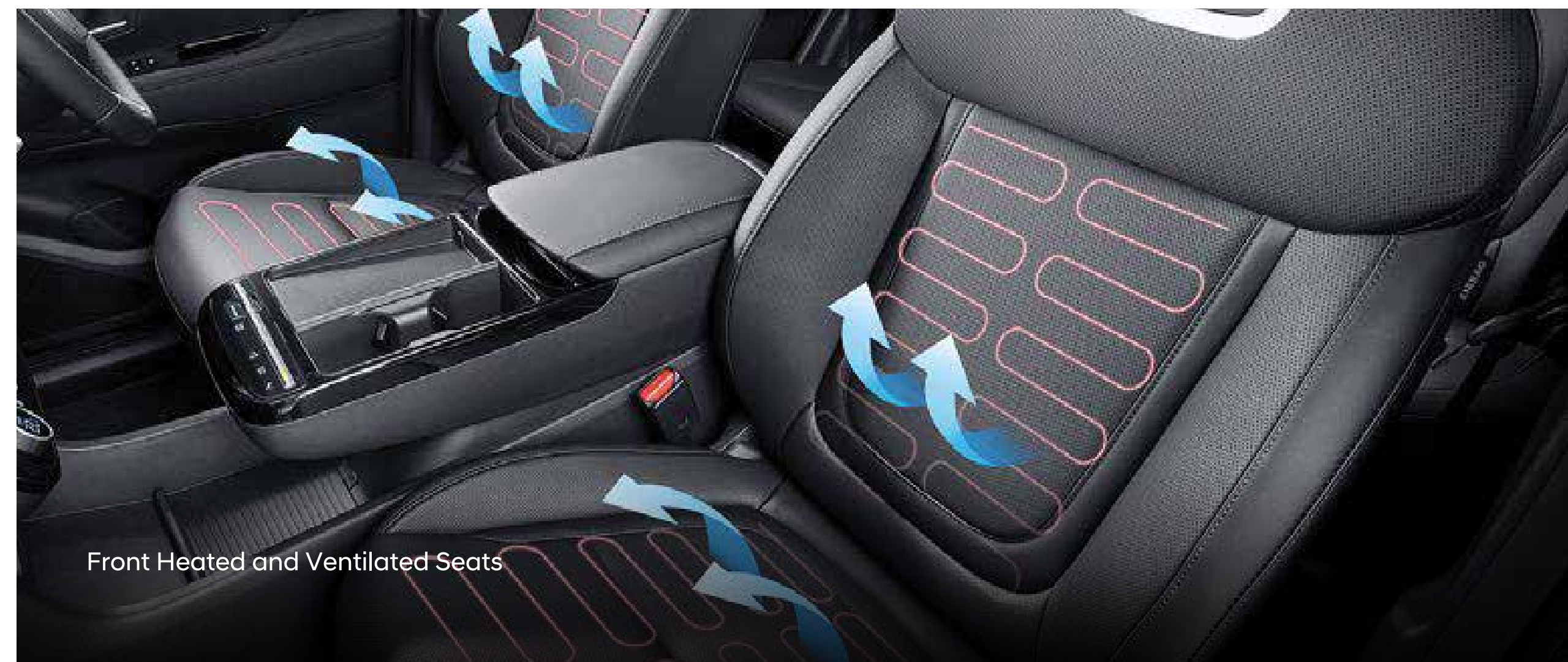
Front Heated and Ventilated Seats