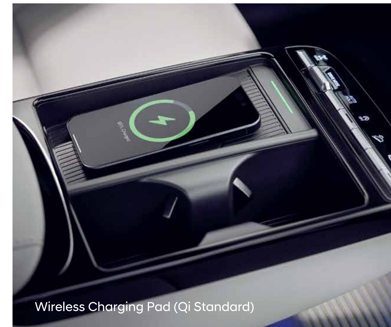
Wireless Charging Pad (Qi Standard)