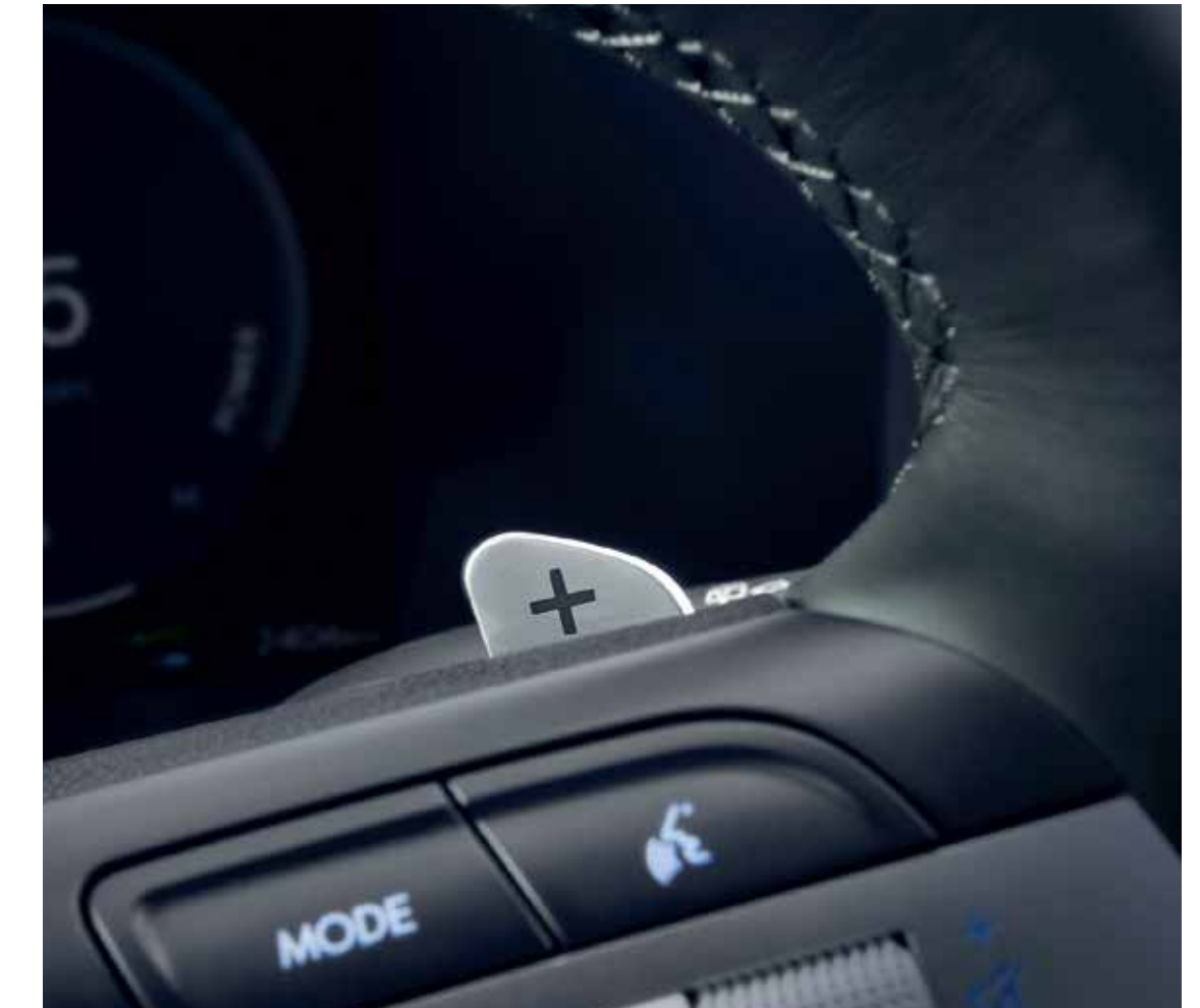
Paddle Shifter-Regenerative Braking Mode