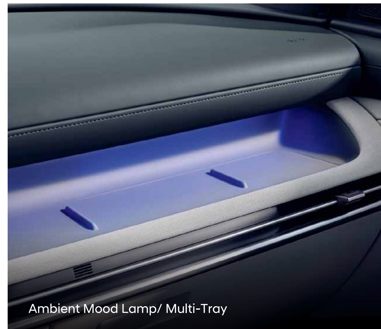
Ambient Mood Lamp/ Multi-Tray