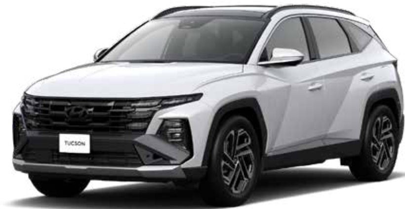
Creamy White Pearl (TW3)