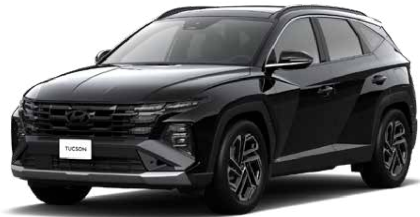
Phantom Black Pearl (TCM)