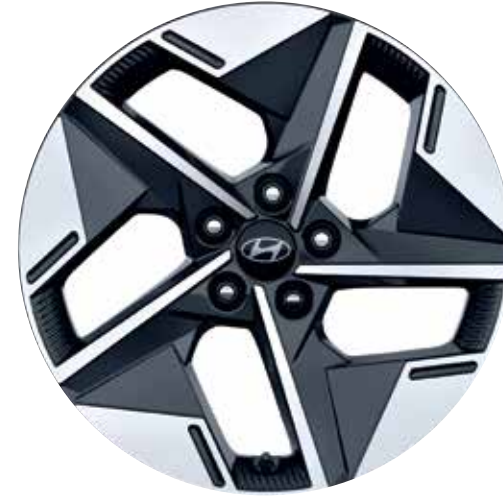
18" Alloy Wheels Prime