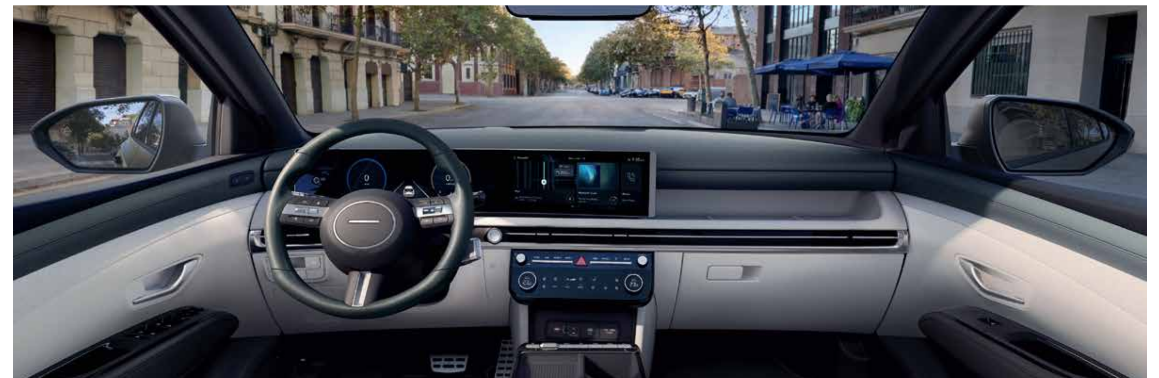
3-spoke Steering Wheel