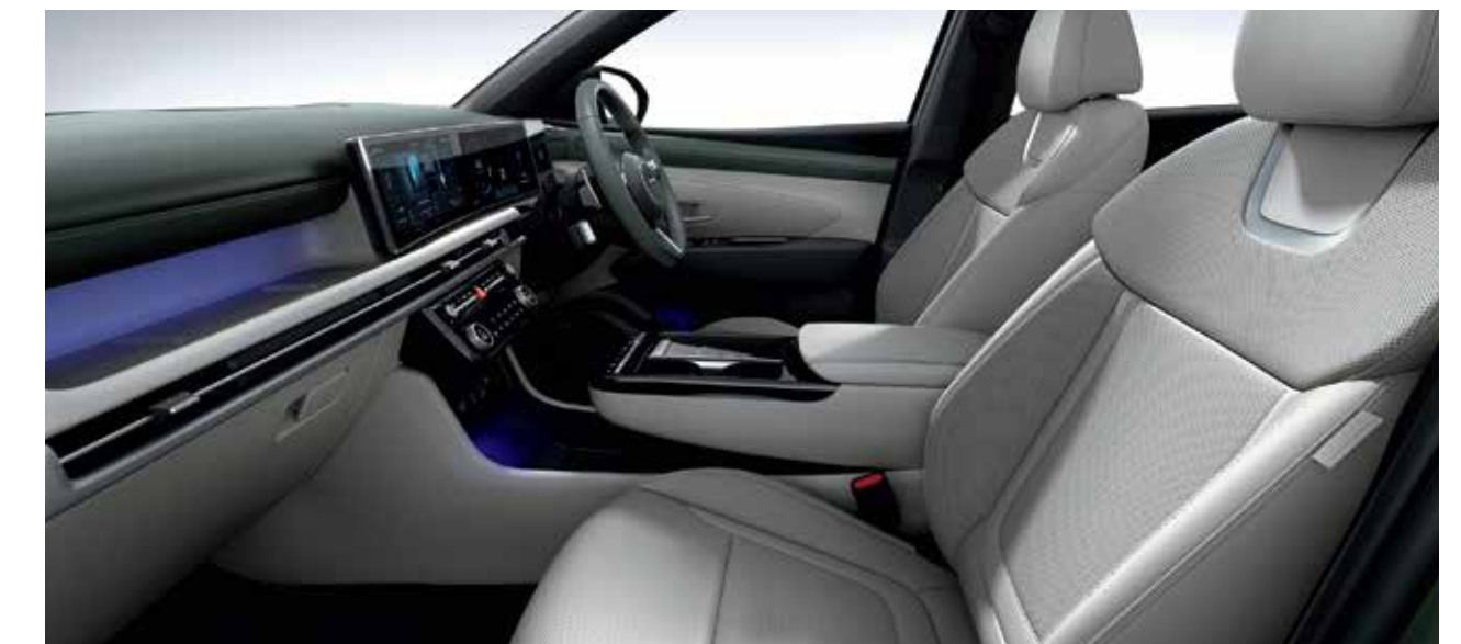
Moss Gray (MMH) Only for Prestige.