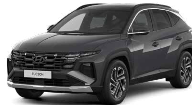
Ecotronic Gray Pearl (PE2)