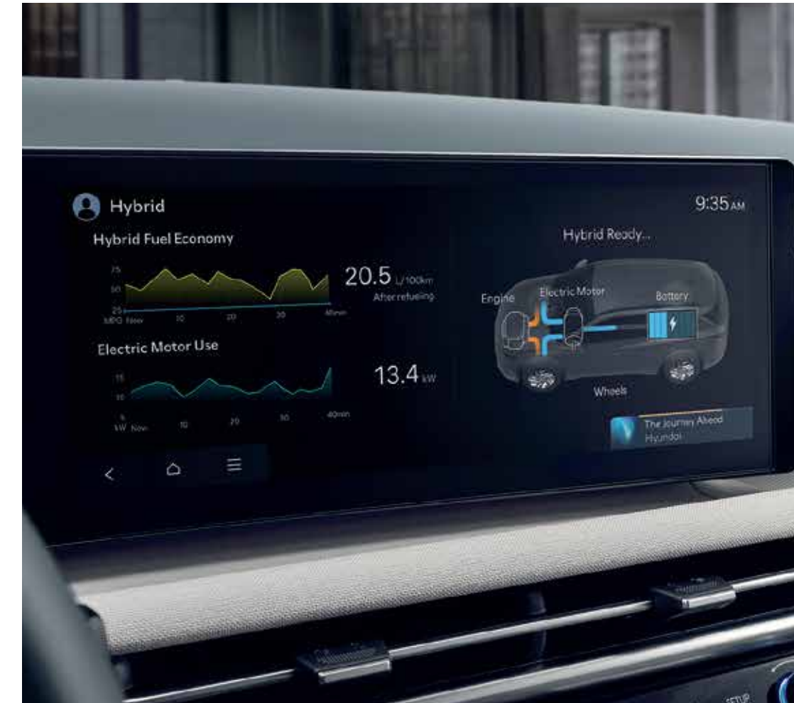
Hybrid Exclusive Features

Feel the difference in every drive with our responsive hybrid technology.