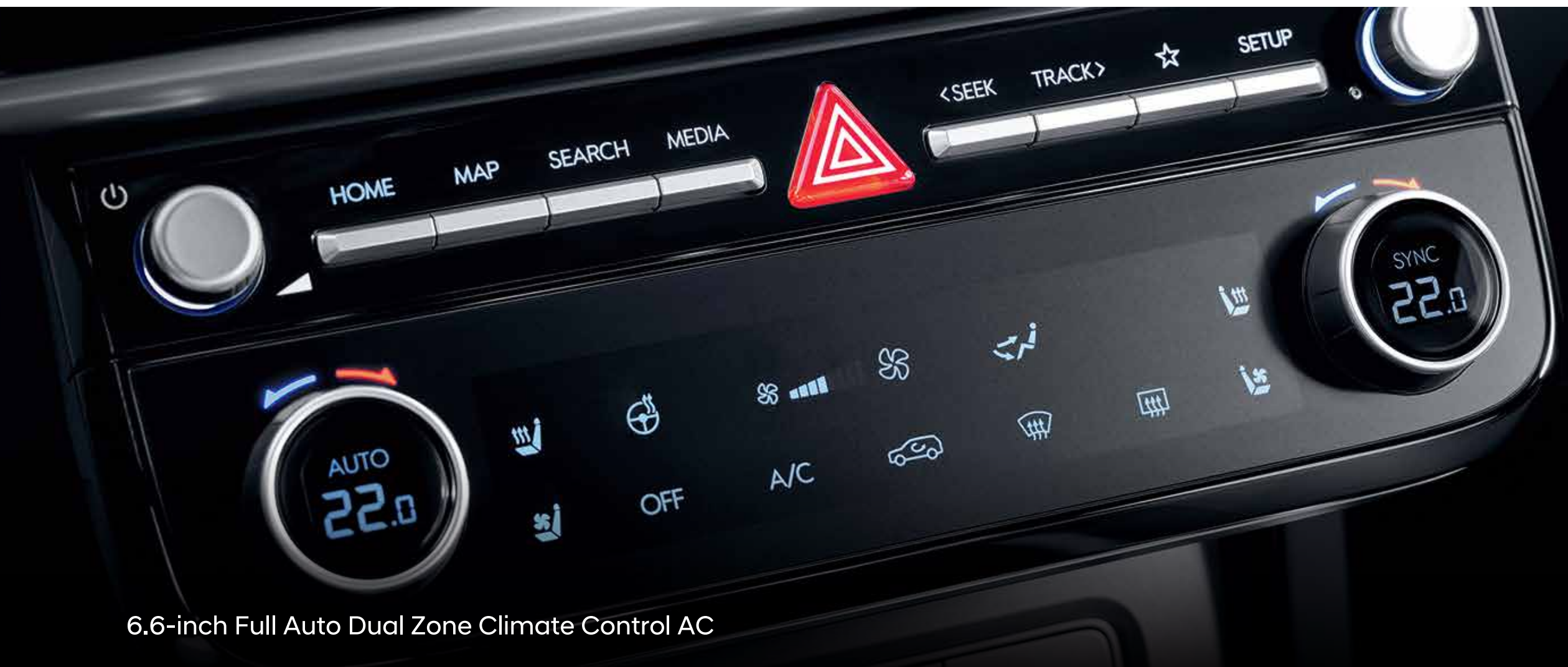
6.6-inch Full Auto Dual Zone Climate Control AC