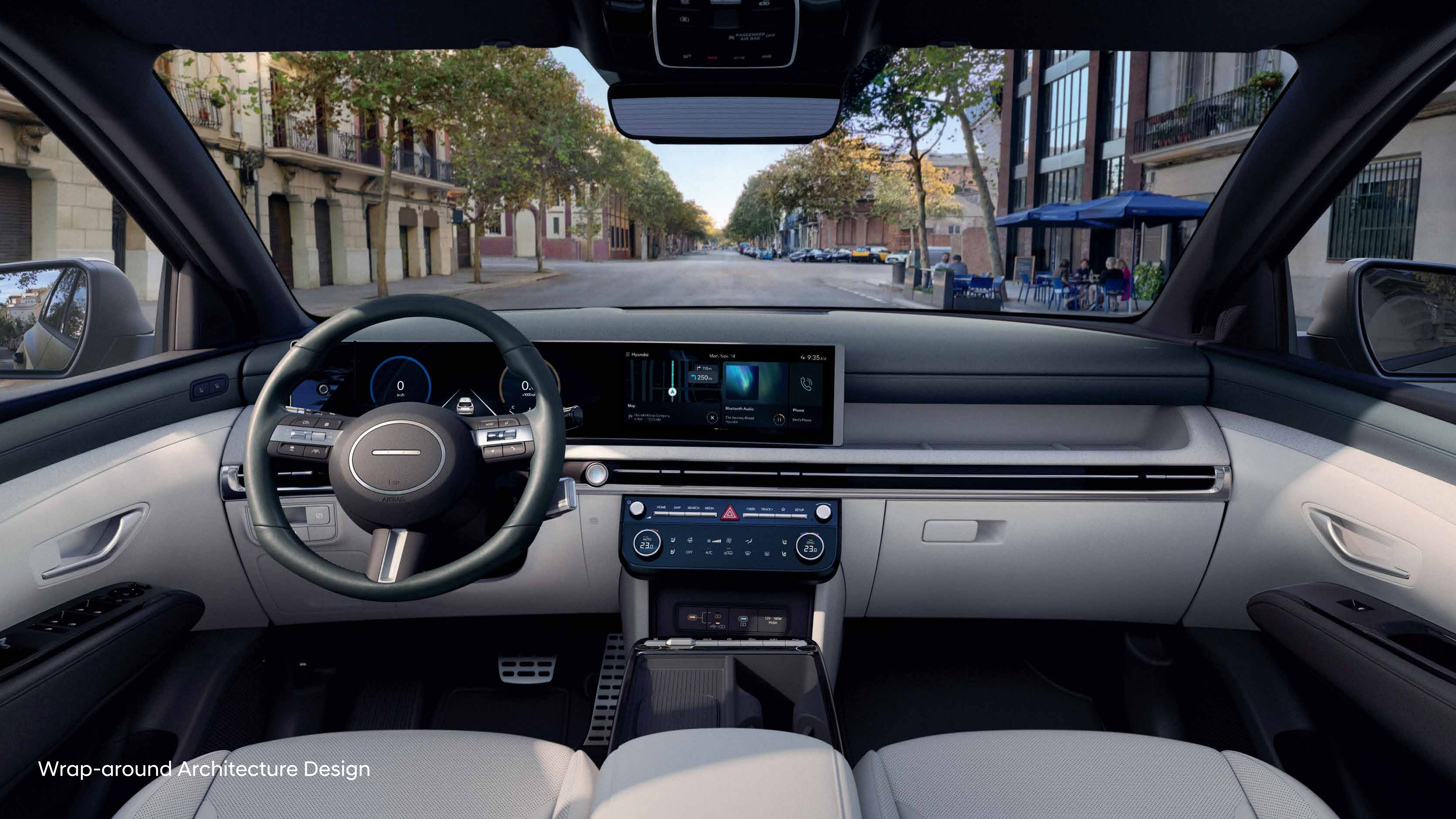
Wrap-around Architecture Design