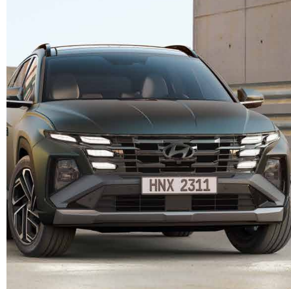
Parametric Jewel Hidden Signature Lamps

Sporting a timeless 3D parametric-style grille and jewel-like surfaces, the new Tucson is for trendsetters with a flair for the futuristic.