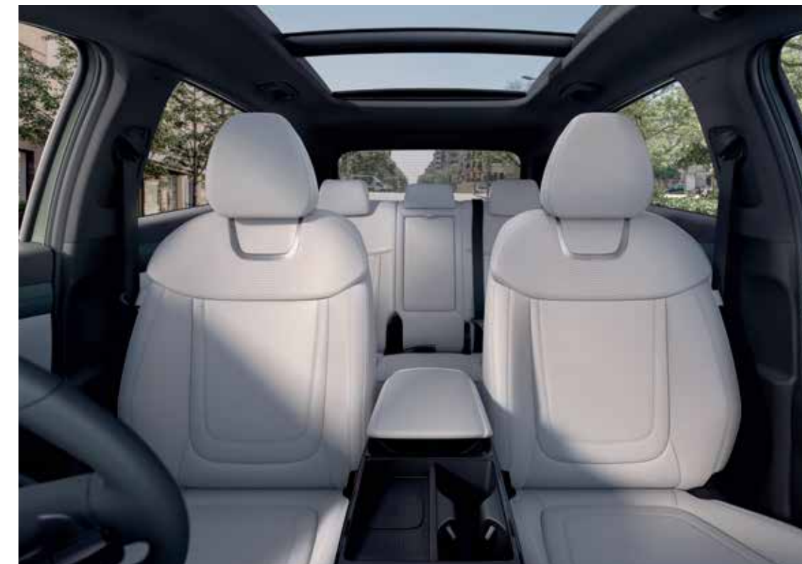
1st & 2nd Row Seat