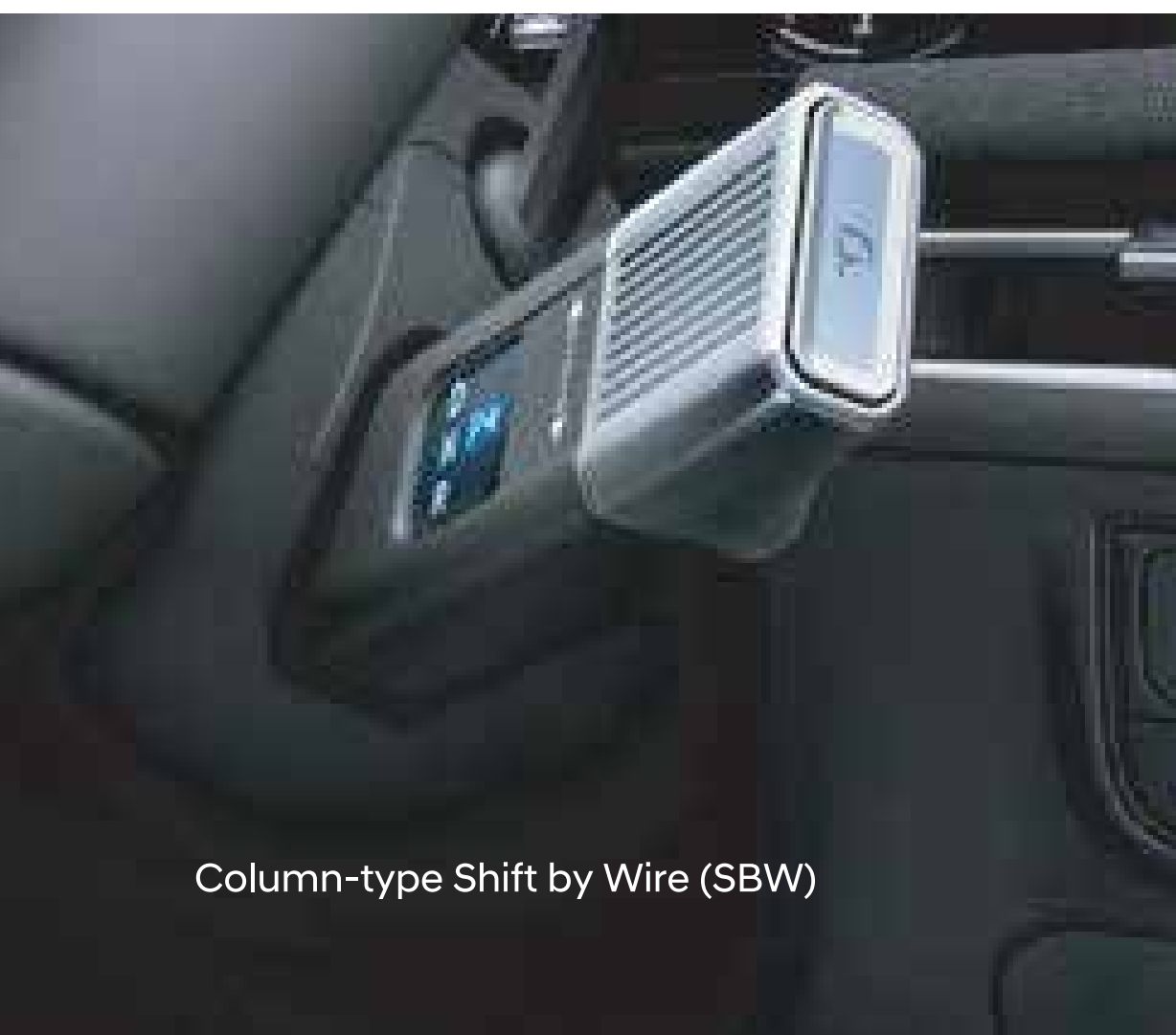
Column-type Shift by Wire (SBW)