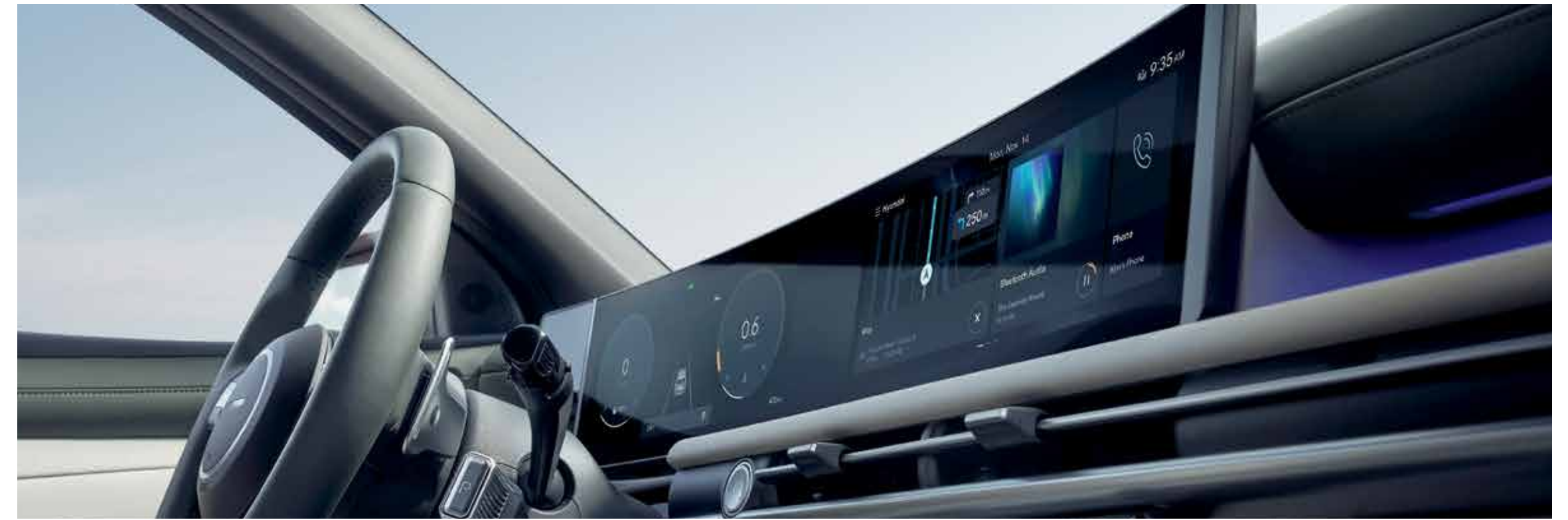
Panoramic Curved Display 12.3-inch Cluster and Infotainment

From its stunning panoramic curved display and floating-type console to its spacious wrap-around design, the new TUCSON is built to provide both practical comfort and futuristic convenience.