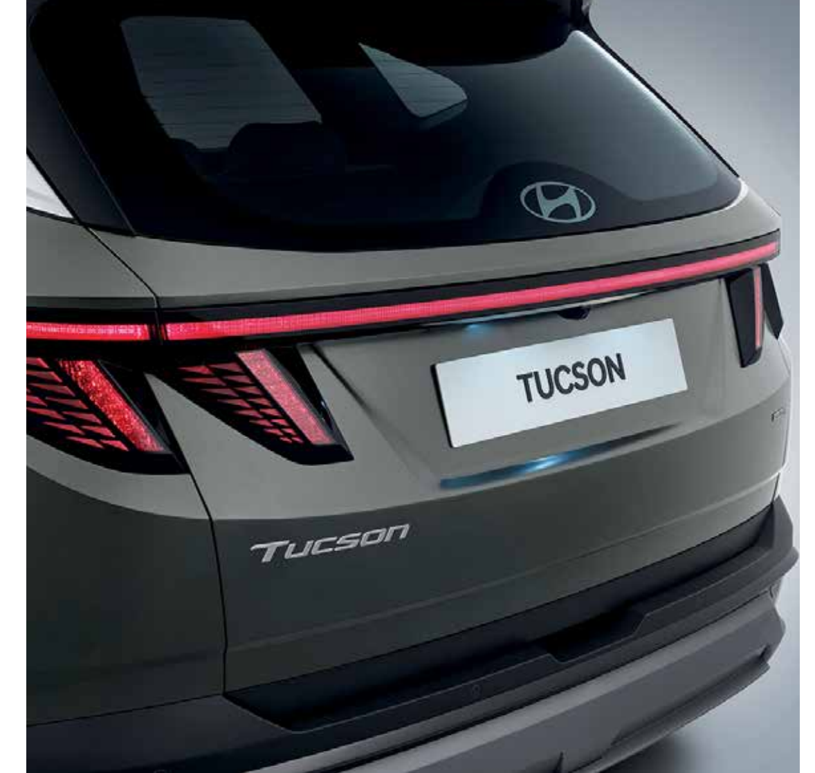
LED Rear Combination Lamps / Rear Bumper / Parametric Jewel Surfaces