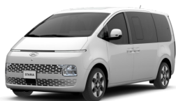
Creamy White (YAC)