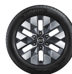
18" Tinted Dark Chrome Alloy Wheels 7-Seater Prestige