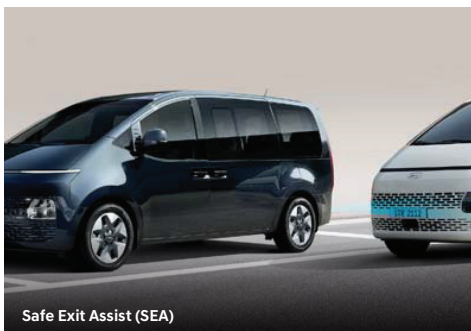
Safe Exit Assist (SEA)