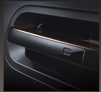
Push Button Door Handle