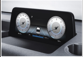
10.25-Inch Information Cluster