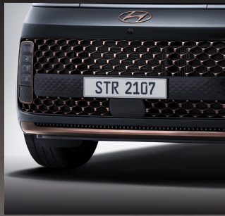
Tinted Brass Chrome Bumper