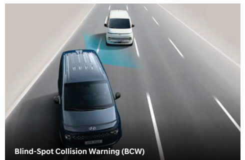
Blind-Spot Collision Warning (BCW)