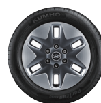
18" Alloy Wheels 10-Seater Prestige