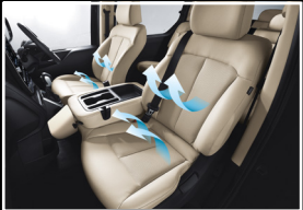
1st-Row Ventilated Seat