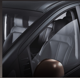
1st-Row Double-Laminated Soundproof Glass