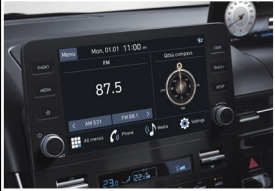
8-Inch Display Audio