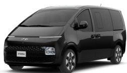
Abyss Black Pearl (A2B)