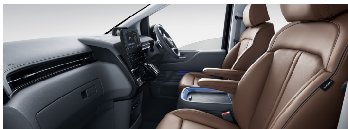
Gray + Brown 2-Tone (SIT) Only for 7-Seater Prestige.