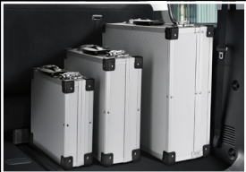
1,024L Boot Capacity