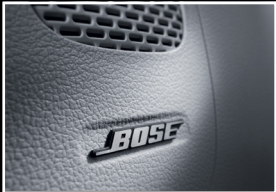
BOSE Premium Sound System