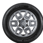
17" Alloy Wheels 10-Seater Style & Prime