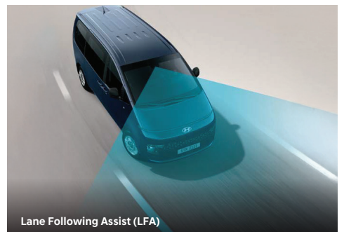
Lane Following Assist (LFA)