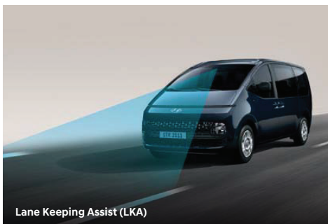
Lane Keeping Assist (LKA)