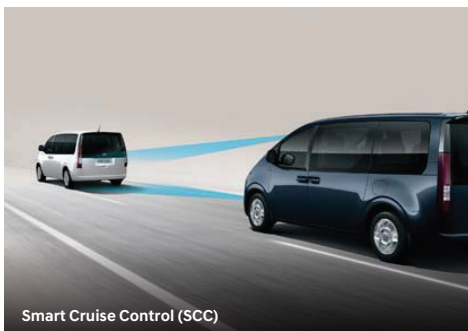
Smart Cruise Control (SCC)