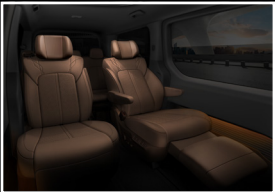
Premium Relaxation Seat