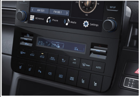
Full-Auto Air Conditioning System