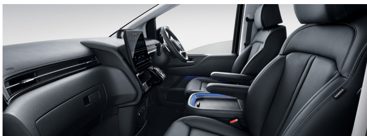
Black Mono + Pattern Insert Film (NNB)