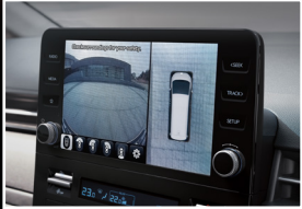
Surround View Monitor (SVM)