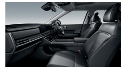
Black Monotone Nappa Leather / Black Ink Metal Garnish Only for Calligraphy.