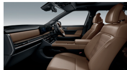
Pecan Brown Nappa Leather / Natural Serenity Oak Garnish Only for Calligraphy.