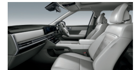
Forest Green Nappa Leather / Eucalyptus Stripe Light Garnish Only for Calligraphy.